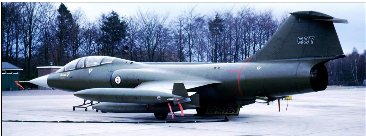
CF-104D 5307, 637, Twenthe, The Netherlands, April 6, 1976.

5306 104636 Mk 1, to Turkey in 1986, wfu 1994