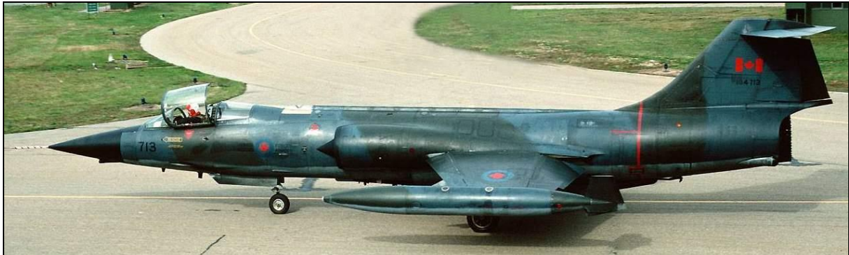
CF-104 1013, 104713, Sollingen, Germany, 1984.

1012 12712 crashed Nov 25.1961 on first flight with Canadair during pre-delivery functional test flight, loss of control during automatic pitch system test, Canadair test pilot Bruce Fleming ejected safely.