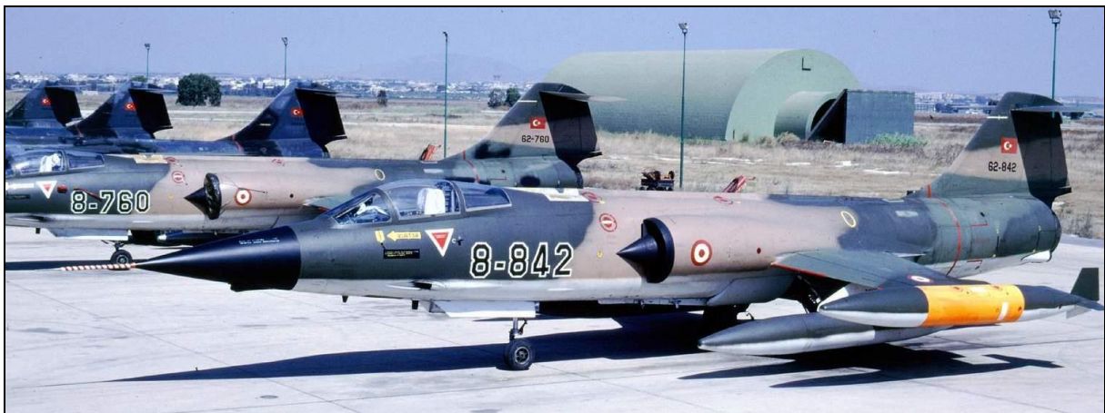
CF-104 1142, 62-842, 8-842, Trapani-Birgi, Italy, August 1, 1991.