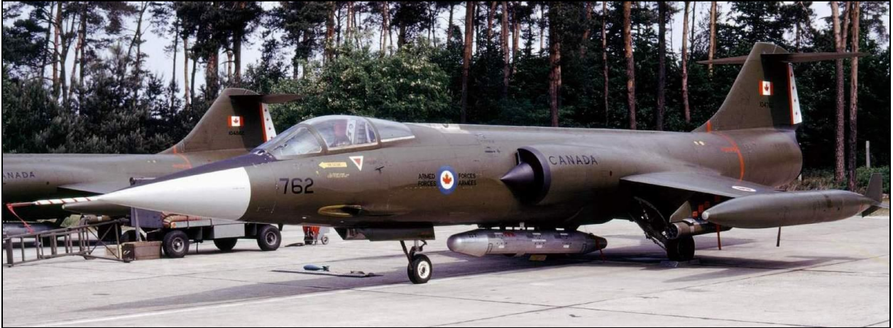
CF-104 1062, 104762, Sollingen, Germany, June 1974.

104761 f/f Apr 12. 1962, t/o/s by RCAF as 12761 Sep 13.1963, first unit 1 AD, 439 Squadron's "Tiger Meet" aircraft at Bitburg AB, 1981; Canada won the Silver Tiger Trophy, sos by CAF Mar 6.1986, tos by Turkey as 62-761 on Mar 13.1986, wfu (date unknown), s/o/s by THK August 27.1993, current status unknown