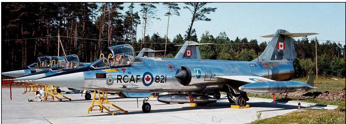
CF-104 1121, 12821, Jever, Germany, June 1968.