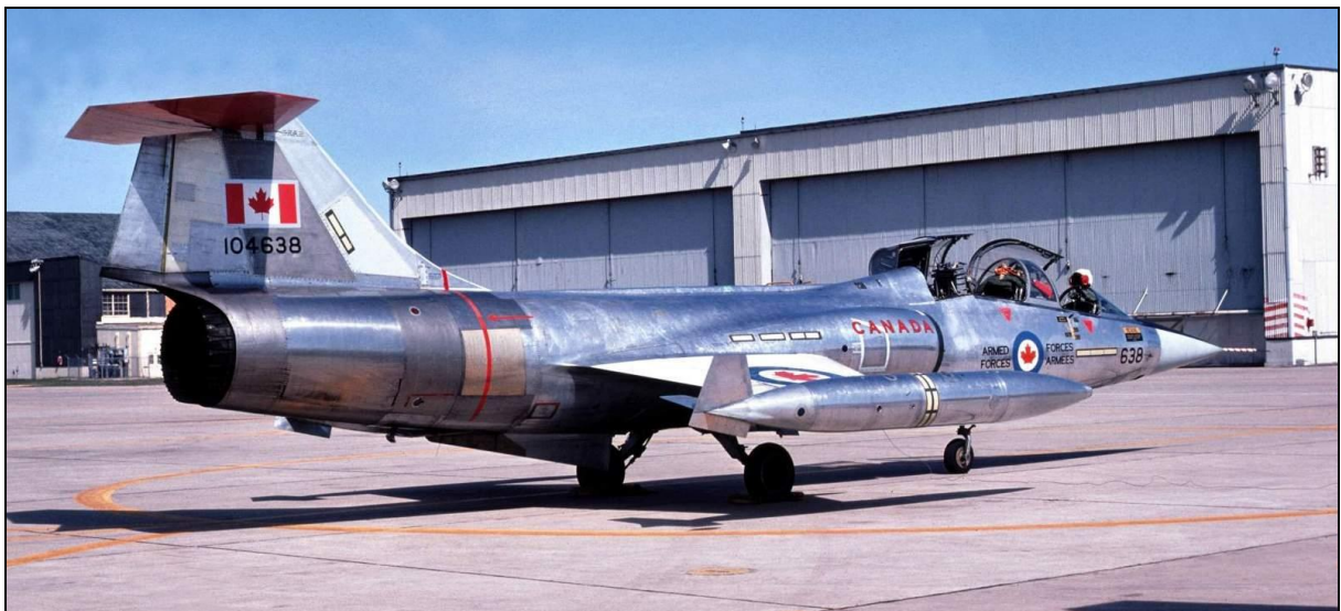
CF-104D 5308, 638, Canada, late 60's

5307 104637 Mk 1 to Norway July 15, 1973 as "637" with 1.392 hrs, wfu Mar 14, 1983 as ABDR at Bodø, as "637" at Bodo Museum 2001, stored at Bodø AB. This airplane is the one being evaluated for future airworthiness and flying (!)