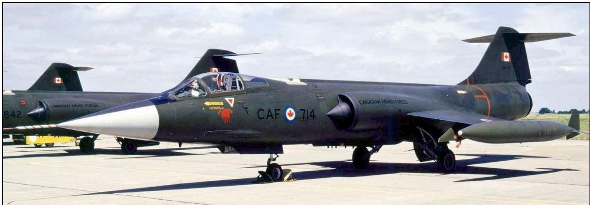
CF-104 1014, 104714, UK, July 1973.

1013 104713 to Turkey February 1. 1986 as 62-713, wfu 1994.