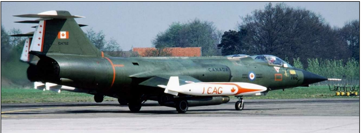
CF-104 1062, 104762, Twenthe, The Netherlands, May 1976.