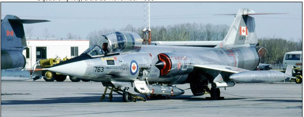
CF-104 1063, 104763, Goose Bay, Canada, May 1979.

104762 1976 at Twenthe for Tactical Weapon Meet, aircraft wore "1 CAG" in red on white wingtip tanks for the Tactical Weapons Meet; crashed June 9.1981 with 1 CAG (421 Squadron pilot); s/o/s 23 November 1983