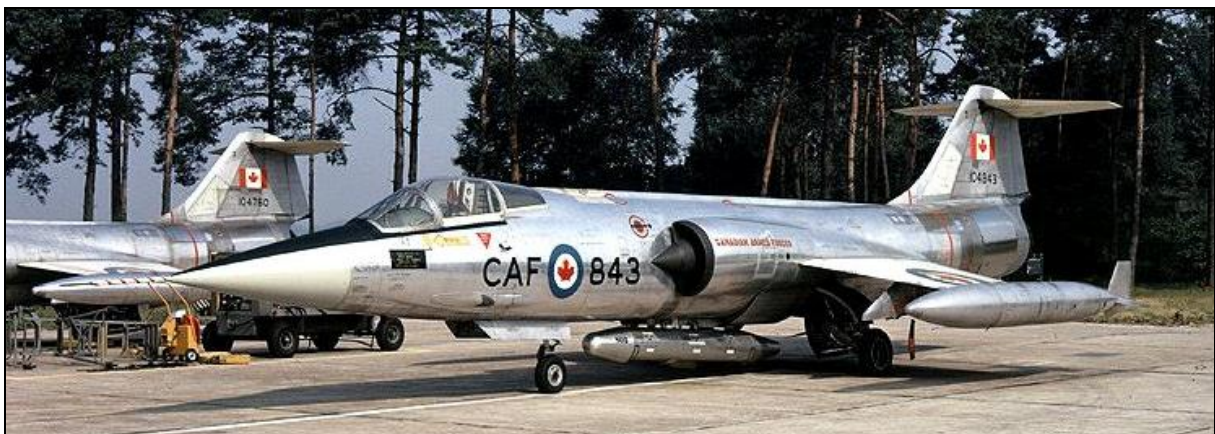
CF-104 1143, 104843, Sollingen, Germany, early 70's.