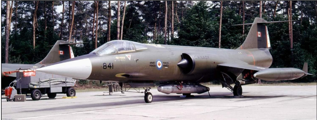
CF-104 1141, 104841, Sollingen, Germany, June 1974.