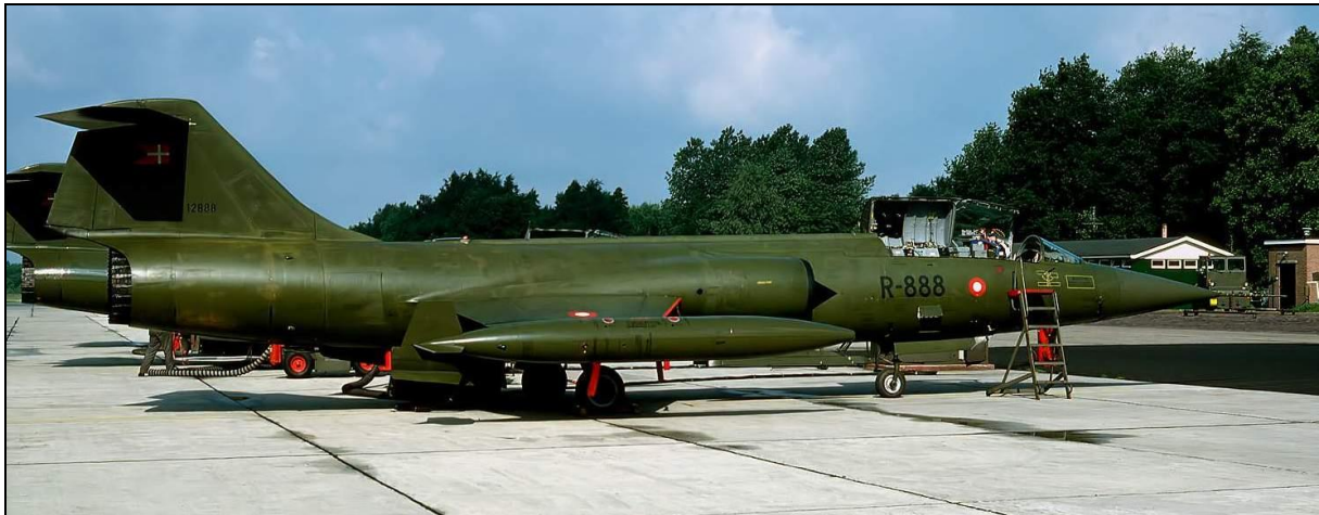
CF-104 1188, 12888, R-888, Twenthe, The Netherlands, June 14, 1979.