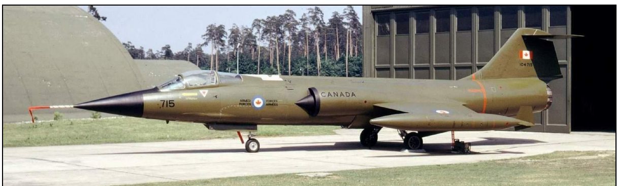
CF-104 1015, 104715, Sollingen, Germany, June 1974.

1014 104714 crashed Feb 12.1976 with 1 CAG after hitting crest of ridge on low level radar navigation mission, pilot killed