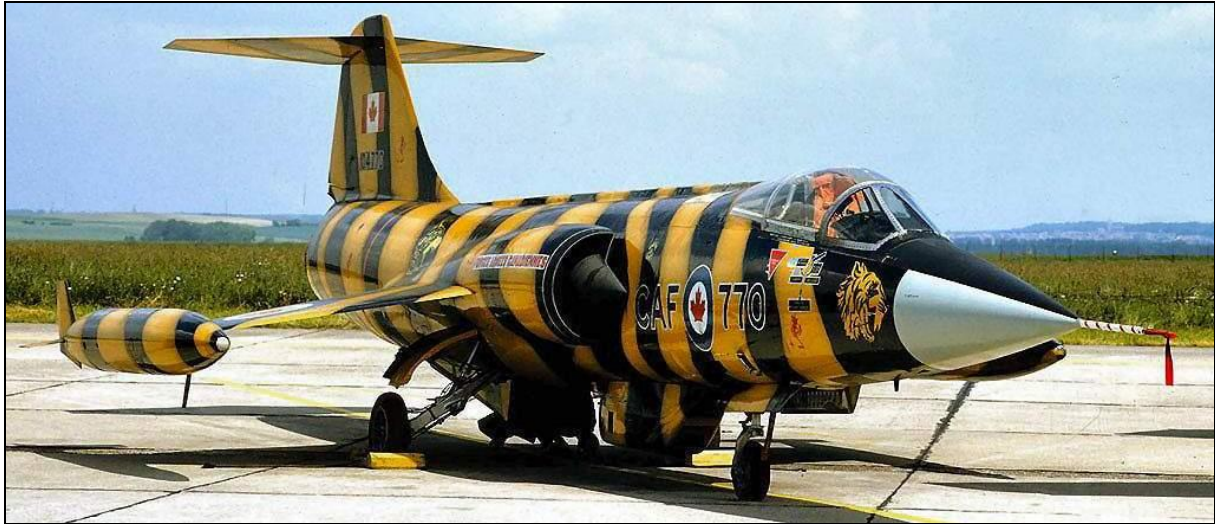
CF-104 1070, 104770, Cambrai, France, June 16, 1972.