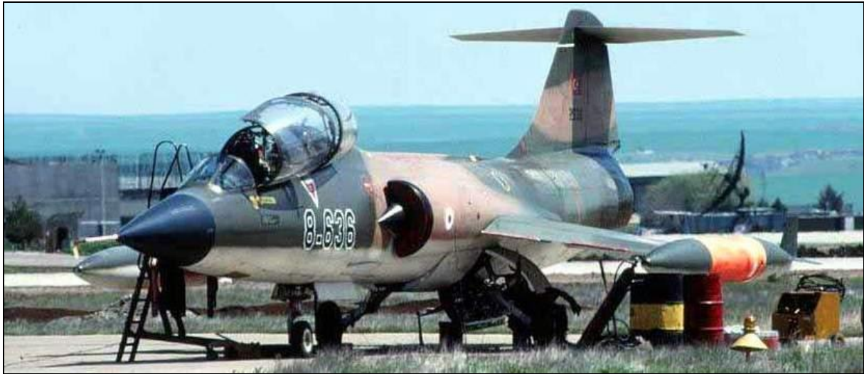
CF-104D 5306, 62-636, Diyarbakir, Turkey, 90's.

5306 104636 Mk 1, to Turkey in 1986, wfu 1994